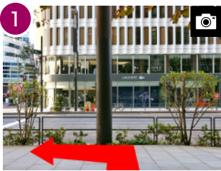
1 Exit the elevator then turn left.