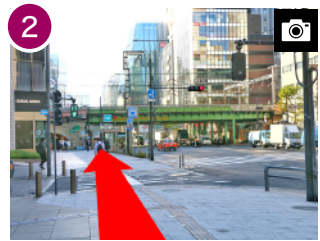
2 Continue straight, passing under the train tracks. (approx. 1 min.)