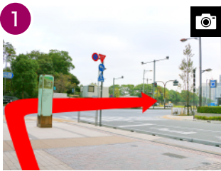
1 Cross the street at the crosswalk visible to your front-left as you leave the elevator.