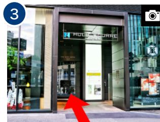
3 Take the elevator to the 4th floor lobby.