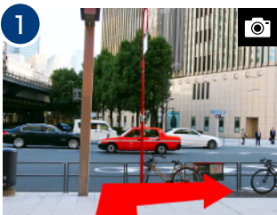
1 Leave the exit, continue to the right. (approx. 1 min.)