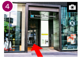
4 The hotel will be on your right hand side. Take the elevator to the 4th floor lobby.