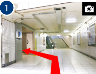
1 Turn left at the "HULIC SQUARE TOKYO" sign before the stairs at exit C1 and take the elevator to the 1st floor.