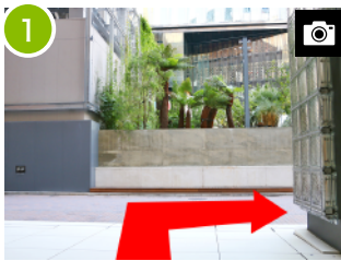
1 As you exit the elevator, turn right.