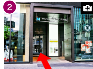
2 Take the elevator to the 4th floor lobby.