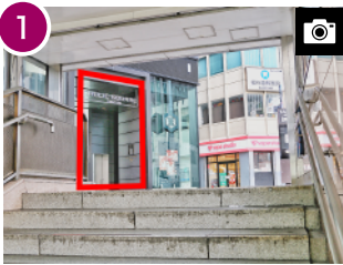
1 As you exit, the hotel will be visible to your front.