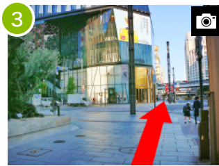
3 Cross the street at the crosswalk, then continue forward.