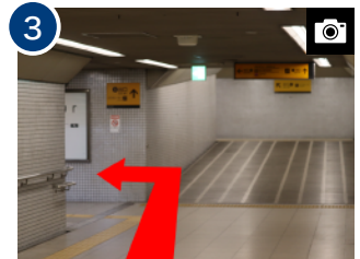
Go up the stairs until the top, and turn left, please.