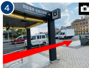
Go up the stairs to go out the exit. Then go straight to cross the Shijo Ohashi bridge.