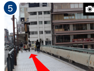
Cross the Shijo Ohashi bridge, and go straight until you get to the pharmacy which is called, MATSUMOTOKIYOSHI.