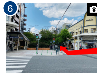
Please turn right at the corner which has the MATSUMOTOKIYOSHI. Then, go straight please.