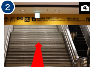
Go up the stairs.