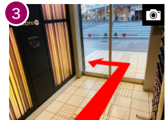
Please make a left turn after the automatic door.