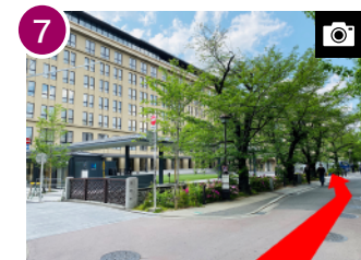
Go straight for a while, and you can find the Rissei Garden Huliic Kyoto on your left. Please go up to the eight floor by the lift. ( about 3 minutes)