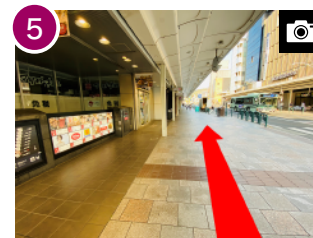
Go straight please (about 2 minutes)