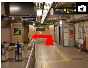
Go out from the East exit, and go straight, Then, make a left turn at the end of the road.