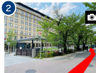
Go straight for a while, and you can find the Rissei Garden Huliic Kyoto on your left. Please go up to the eight floor by the lift. ( about 3 minutes)