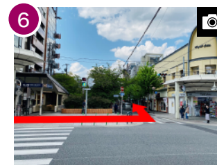
Please make a left turn at the corner which has the MATSUMOTOKIYOSHI. Then, go straight by the Takase River.