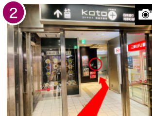
The lift is on the left after going straight. Please go up to the first floor.