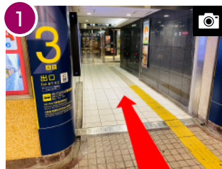
Please make a right turn at exit 3. Then, go straight through the door of KotoCross Hankyu Kawaramachi.