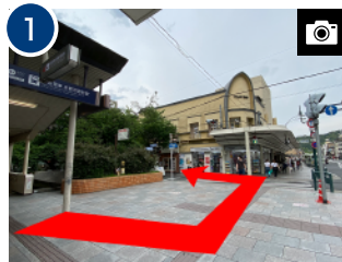
Go up to the street level, turn left on the second floor, and go straight along the Takase River.