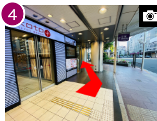
Please make a left turn at the building.