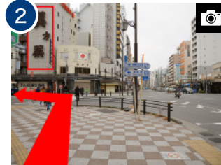
Cross the street toward the herbal medicine sign and turn left.