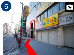
Take the elevator to the 13th floor lobby.