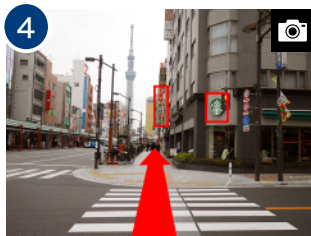
Passing the Starbucks, the entrance to the hotel is at the far end of the Papsu drug store.