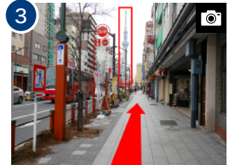
Facing TOKYO SKYTREE, walk straight forward. (approx. 3 min.)