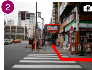
2 Follow the Kaminarimon Entrance passage to the left for about 40 meters to get to Kaminarimon.