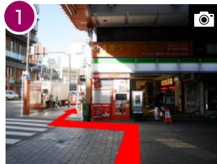
1 Getting out of the elevator, a Family Mart will be visible.