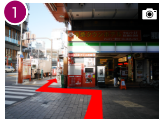
1 Getting out of the elevator, a Family Mart will be visible.