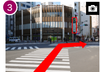
3 Cross the scramble intersection at Kaminarimon toward the Mitsui Sumitomo Bank (SMBC) and continue to the right. (approx. 1min.)