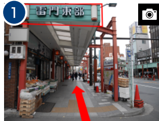
1 Leaving the exit, follow the arcade on the east side of Kaminarimon. (approx. 1 min.)