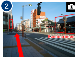
With Kaminarimon to your right, cross the street toward the Mitsui Sumitomo Bank (SMBC) and continue straight. (approx. 1 min.)