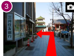
Turn left at Mitsui Sumitomo Bank (SMBC) at the end of the street, and continue walking straight. (approx. 1 min.)