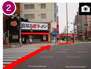
Continue straight until you approach Kaminarimon. (approx. 2 min.)