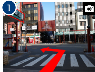
Turn left at the end of the street, following the arcade on the east side of Kaminarimon. (approx. 1 min.)