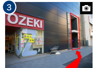
The hotel is in the building with the OZEKI supermarket on the corner. Take the elevator to the 13th floor lobby.