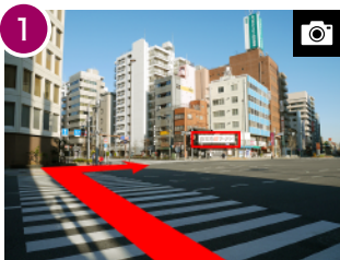
After getting out of the elevator, cross the street in front of you. Then, cross the street one more time toward the AEON store.